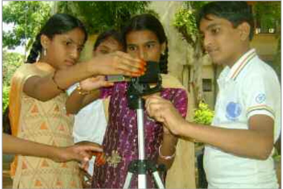
Children from rural schools of Medak district go through the basics at a CAMP workshop in 2009

Should children only be the consumers of information? Should they not also have a voice to be able to tell stories from their own perspectives?