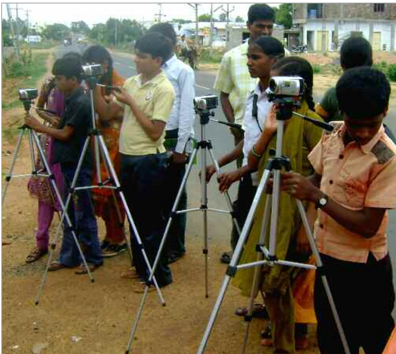
Children at the CAMP workshop in 2009 practice different shot sizes in the outdoors

http://www.viddler.com/explore/CAMP/ . A few videos have also been uploaded by Unicef on: http://www.youtube.com/user/unicefindia .