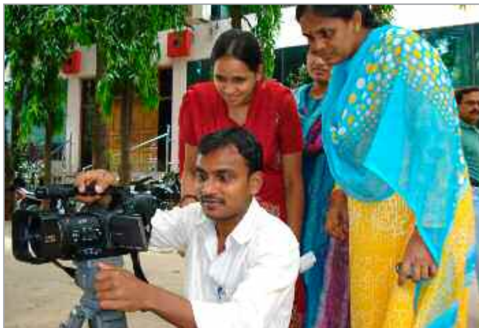
Participants at the Training of Trainers Programme try out their hand at fixing the camera on a tripod