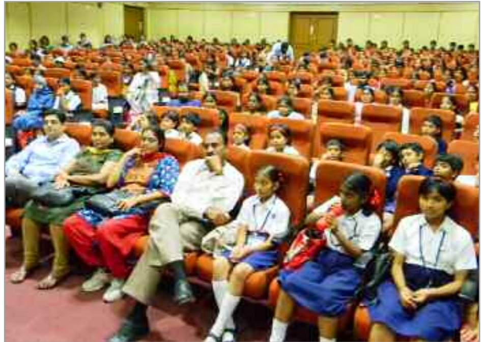
The two-day festival of films produced by children opened to a jam-packed auditorium

The highlight of the inauguration was that four children from both urban & rural backgrounds lit the lamp. Children were also seen enthusiastically filming and clicking pictures of the event.